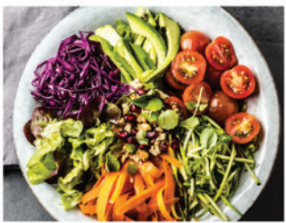
Delicious vegetarian lunch buffet with vegan and meat options