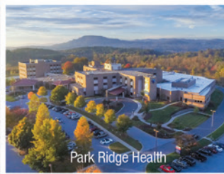
Adventist hospital adjacent to our community